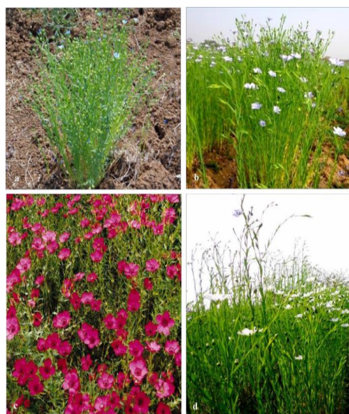
Figure 2: Plant types in respect to height and colour of flower; a. Bushy (Bushy branching); b. Semi erect (Lateral Branching); c. Red colour flower of linseed with Semi erect (Lateral Branching); d. Long erect (top branching)