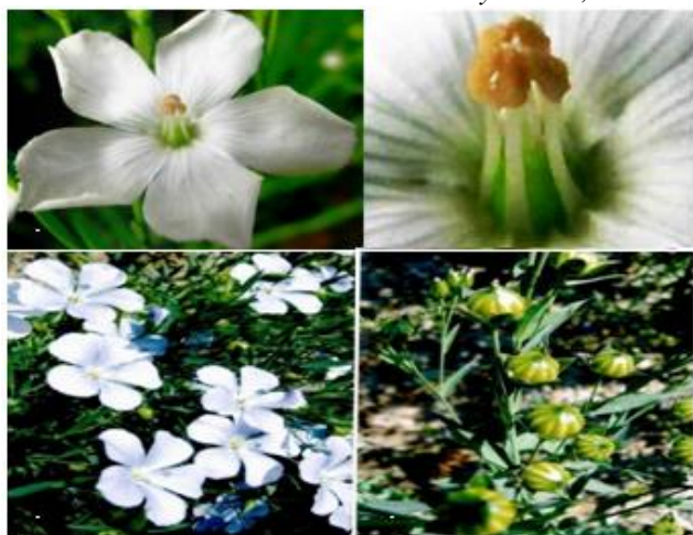
Figure 4: Flowering and fruiting of linseed plants; a. Individual flower with five petals; b. Fused stamens; c. Number of flowers in a plant; d. Capsules bearing seeds of Linum usitatissimum L. plant