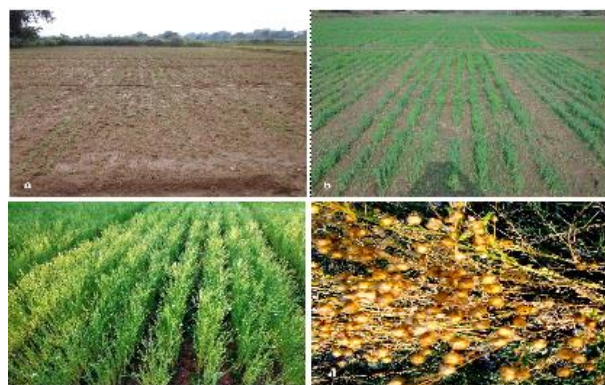
Figure 5: Field preparation and cultivation; a. Field shows pre-seed germination/starting of seed germination; b. Seedling stage observed from field; c. Linseed plants bearing a number of flowers in the erect branches. d. Matured capsules ready to harvest