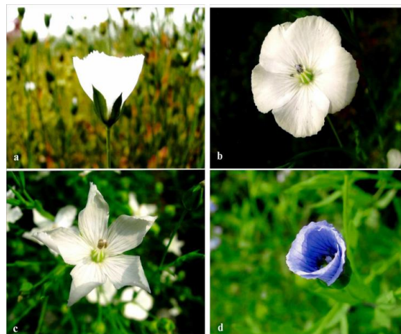
Figure 3: Shape of flower; a. Funnel shape; b. Disc shape; c. Star shape; d. Tubular